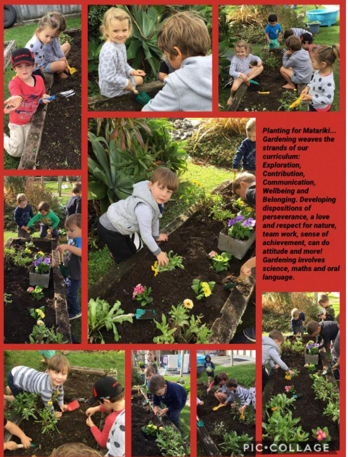
Planting for Matariki... Gardening weaves the strands of our curriculum: Exploration, Contribution, Communication, Wellbeing and Belonging. Developing dispositions of perseverance, a love and respect for nature, team work, sense of achievement, can do attitude and more! Gardening involves science, maths and oral language.