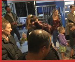
Waipu Primary Kapa Haka visit... Tuakana teina... (whereby the older or more experienced teaches the younger or less experienced.) Strengthening relationships with the school. Matariki Celebration with whanau...