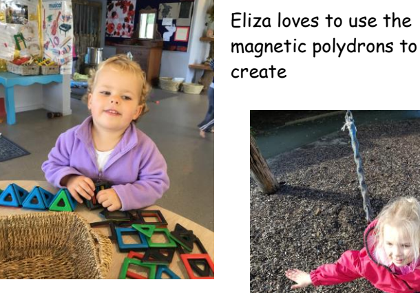
she can be a spiderman